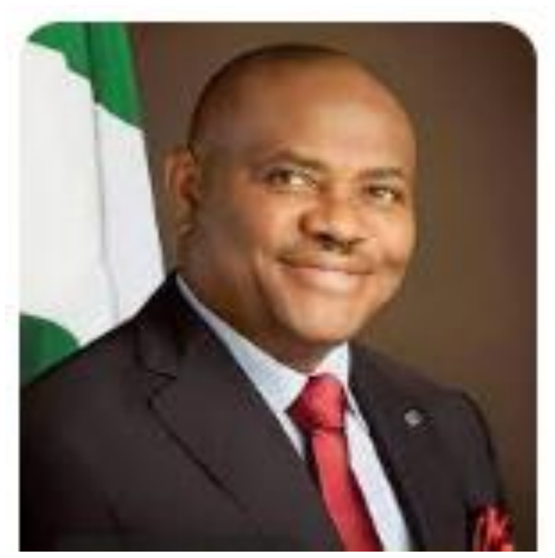
His Excellency, Barrister Nyesom Wike, CON Honourable Minister of the Federal Capital Territory Federal Republic of Nigeria